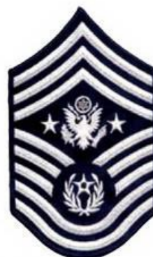
Chief Master Sergeant of the Air Force