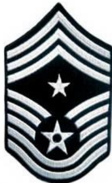
Command Chief Master Sergeant