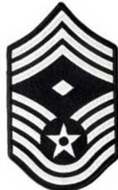
Chief Master Sergeant First Sergeant