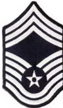
Chief Master Sergeant (E-9)