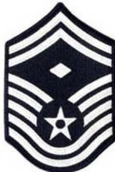
Senior Master Sergeant First Sergeant