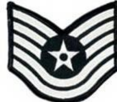
Technical Sergeant (E-6)