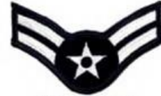
Airman First Class (E-3)