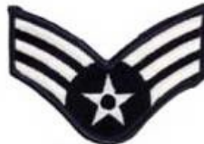
Senior Airman (E-4)