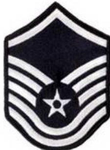
Master Sergeant (E-7)